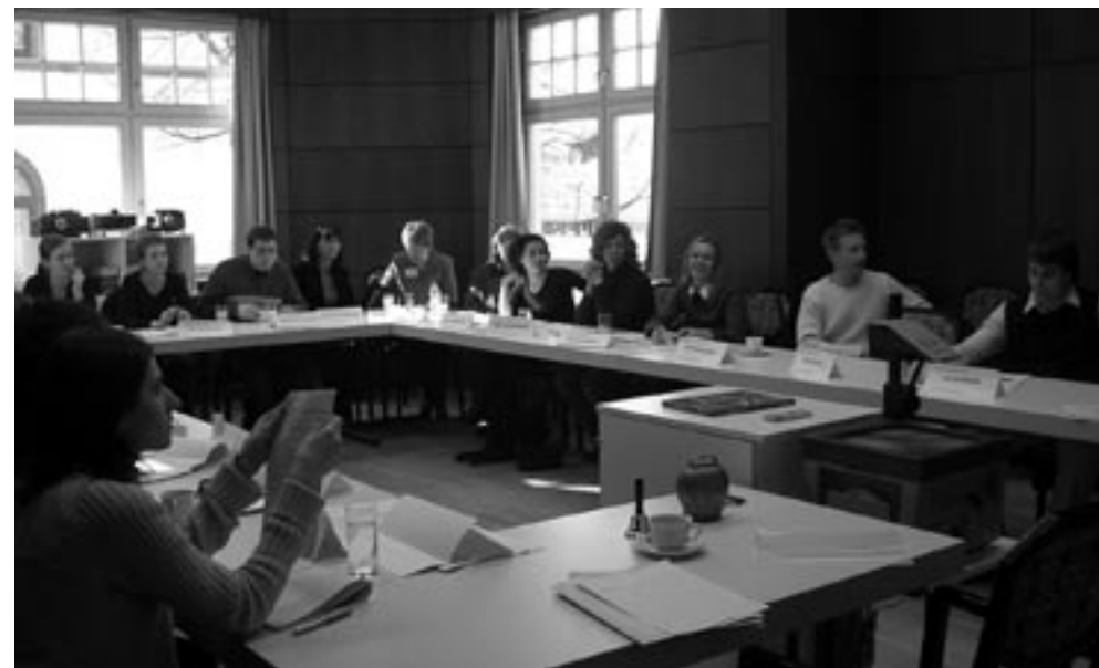
Constructive criticism and vivid exchanges of ideas characterized the discussions following presentations.

In 1837, John Deere founded the company that would come to bear his name. Incorporated as Deere & Company in 1868, it has grown from a one-man blacksmith shop into a worldwide