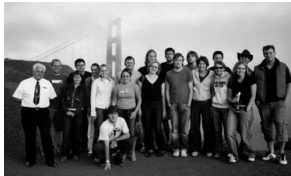
Finale group photo before the Golden Gate Bridge.