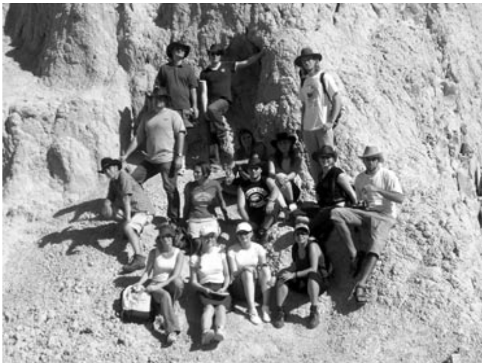
Even cowboys need a rest.

Our detour through Yellowstone more than exceeded expectations, and some members of our group had a close encounter not only with two buffalo, but with a black bear. Heading south through Idaho, we further explored the history of travel and communication at the Golden Spike National Site at Promontory Point, Utah, where the first transcontinental railroad was completed in 1869.