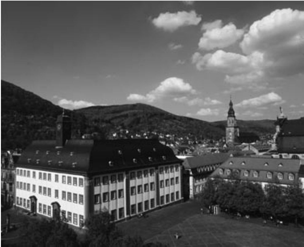
Heidelberg's "Old University" and University Square in the historic city center

Further plans include the addition of B.A. and Ph.D. programs to the HCA's educational portfolio. Please check our website for information and updates on these exciting new educational ventures!