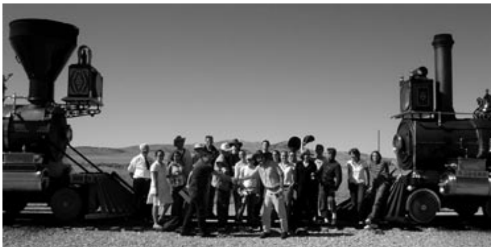
Western Excursion Group Photo: a symbolic joining of hands at Promontory Point, UT, where the Golden Spike was driven.

Through the wide open spaces of northern Wyoming and southern Montana we were led directly into Yellowstone National Park, where we spent two days exploring the natural history of the American West, as well as the history of public and private efforts to conserve some of the most famous natural wonders of the United States. Our two days of exploration into Western nature kicked off in grand fashion as we awoke to a herd of elk relaxing outside of our hotel and continued in grand fashion, with hikes and visits to geysers, waterfalls, and lakeshores.