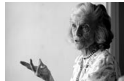
Eunice Kennedy Shriver

"There were so many things she couldn't do, but she could swim," he exclaimed. This is the lesson he learned: "No matter who they are, everybody has a skill that others don't have." Shriver believes in giving these people the opportunity to develop these skills, and believes that one-on-one friendships can provide such opportunities.