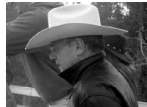
A souvenir from the American West: the famous Stetson.

violent conflicts. After a first encounter with a (peaceful) buffalo herd in Wind Cave National Park, we visited two of the more controversial memorials in the Black Hills: the Crazy Horse Memorial and Mount Rushmore National Monument. The violent end of the conflict between the Lakota and the U.S. government stood at the center of Wounded Knee Museum, which we visited in Wall, South Dakota. We also encountered the present situation while traveling through the Badlands and the Pine Ridge Reservation. This exploration of the Indian Wars was concluded with a visit to the Little Bighorn Battlefield in Montana, site of "Custer's Last Stand," and the museum that has been erected there by the Crow Indians.