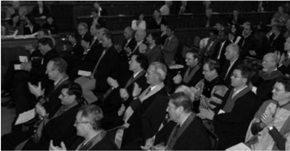
The audience, including parents and families of the graduates and HCA faculty and staff, enjoys the keynote address in the Great Hall of Heidelberg's "Old University"

China's continuing success will undoubtedly shake things up in the world. Not only will its GDP eventually overtake that of the U.S., and the EU and perhaps go well beyond either, but its competitive prowess also gravely threatens Western living standards. So what? The postwar rise of Japan and Asia's "Little Tigers" also disturbed many Western interests. But the competitive adjustments made everyone better off in the end. Why should China's rise, or India's for that matter, have different effects?